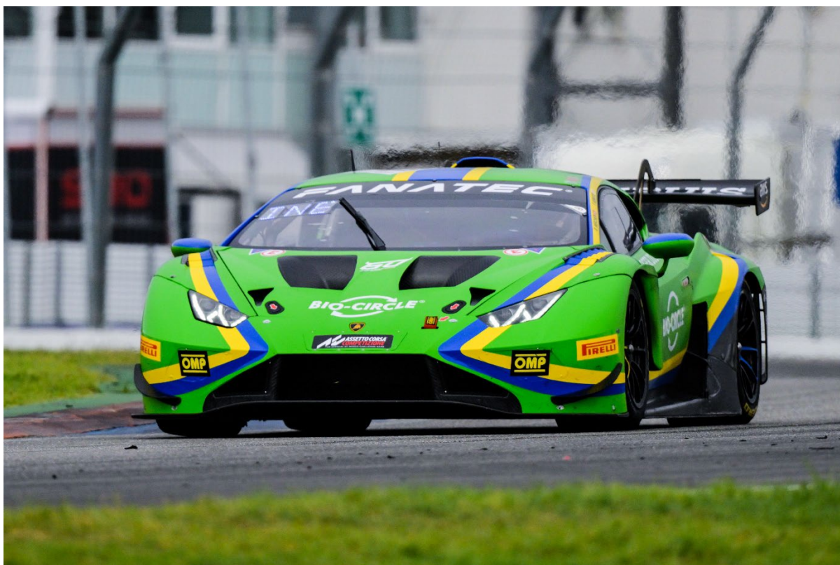
#163 – Rolf Ineichen / Yuki Nemoto

De Leemer and Rossi. Ineichen held off Salmenautio until the very last lap when the Madpanda driver used a track limits infringement to get an advantage and passed the VSR Lambo demoting it to fourth in class. Moulin finished in ninth collecting another points finish.